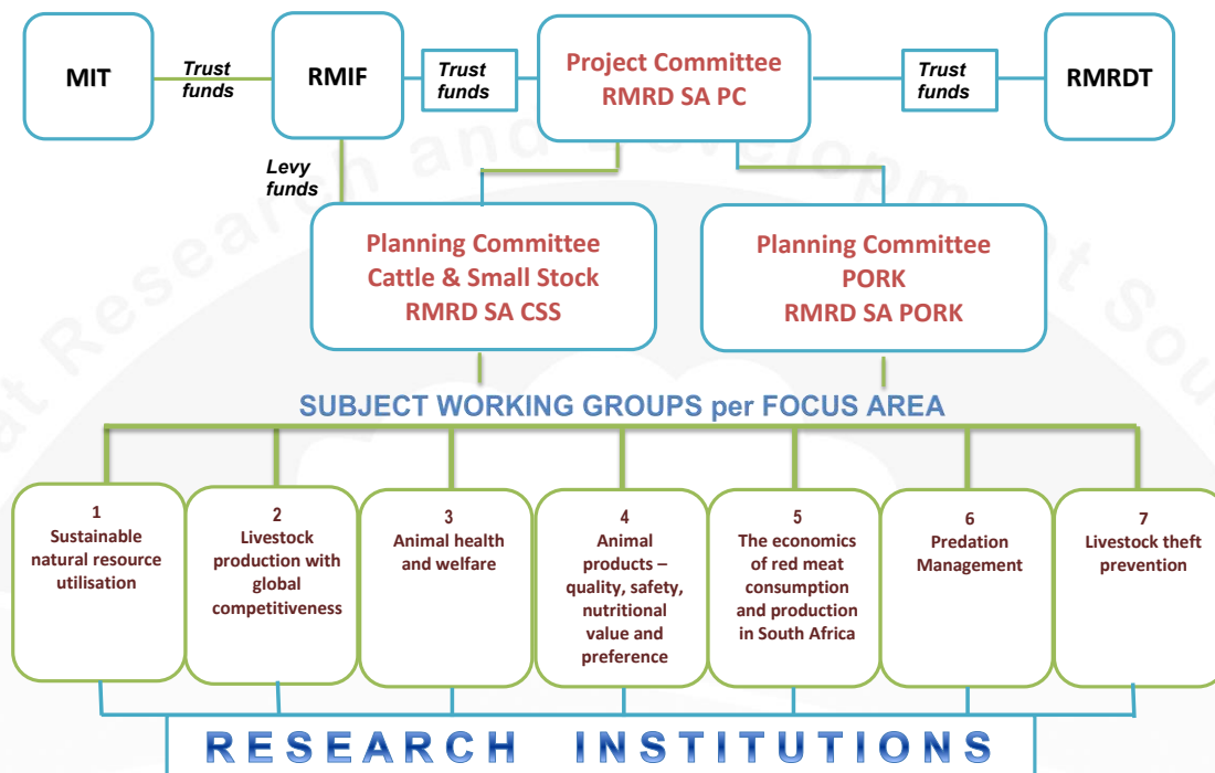
Figure 1: Research structures in the Red Meat Industry involved in the planning of R & D, obtaining and distributing of funds.